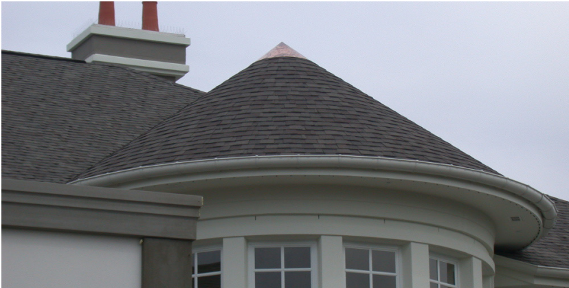
1 Florence Ct, Surfers Paradise QLD