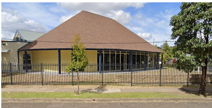
Samoan Church 12 Frederick St, Lidcombe NSW