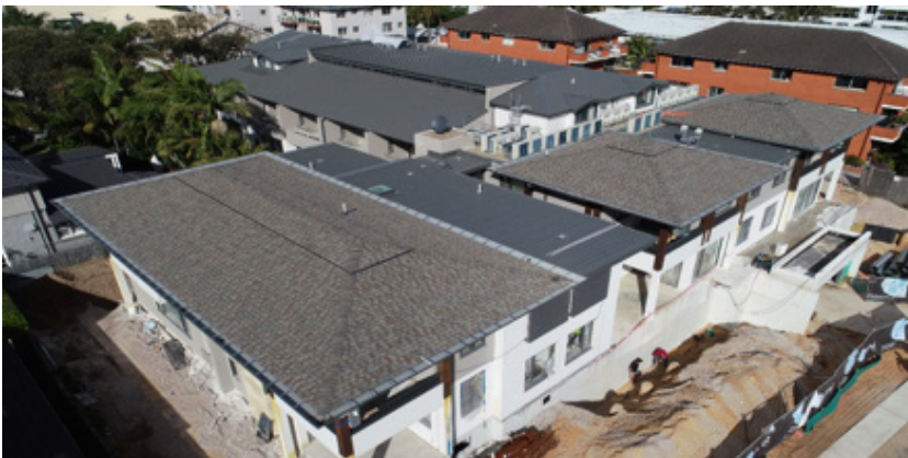
129-133 Lagoon St Narrabeen NSW

Shows a good example of a Chinamans hat peak ventilation.