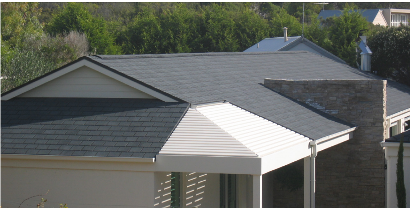
10 Kindra Cl, Portsea VIC