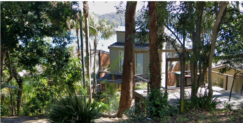
Boathouse 36 Hudson Parade Clareville NSW