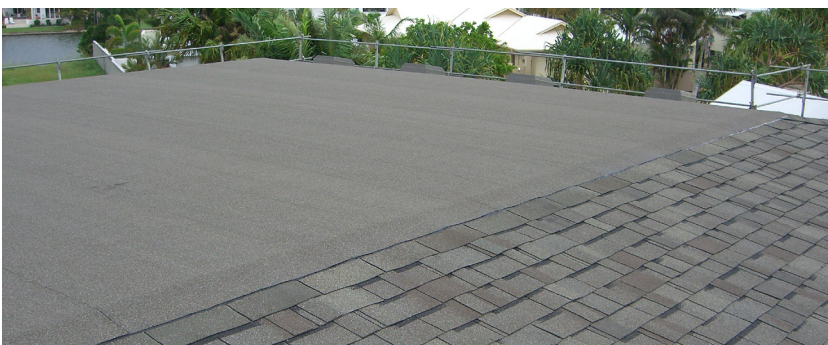
17 Masthead Quay, Noosaville QLD