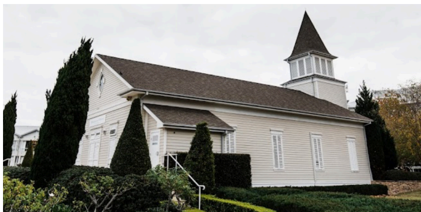
Breakfast Point Community Hall