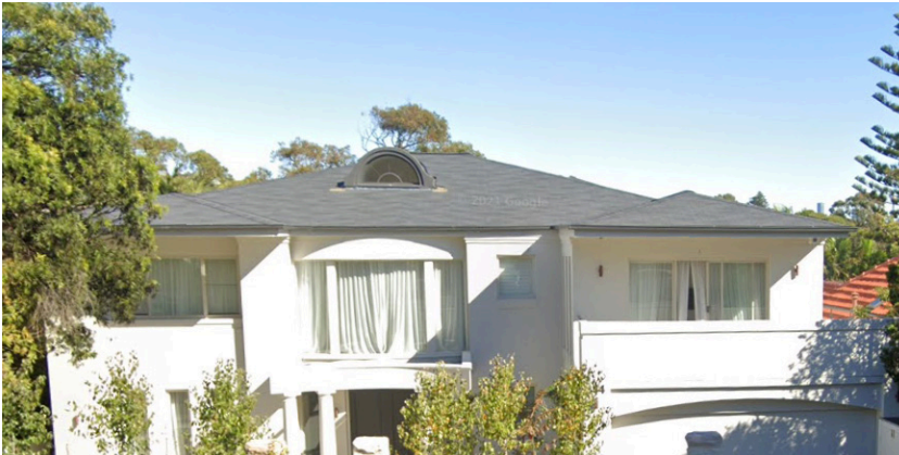
114 Hopetoun Ave, Vaucluse NSW