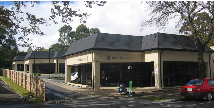
Berwick Retail Shops 11 Gloucester Ave, Berwick VIC