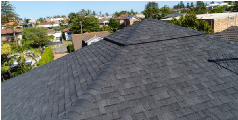
24 Lyle Street Narrabeen NSW

Shingle: Independence in Georgetown Grey