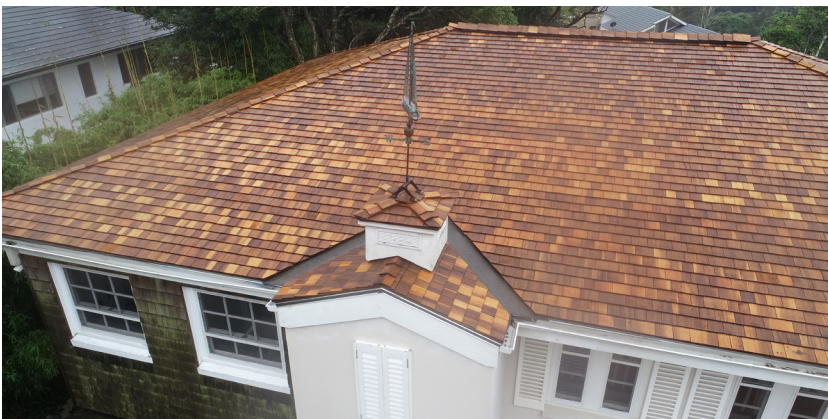
2A Coolong Rd, Vaucluse NSW