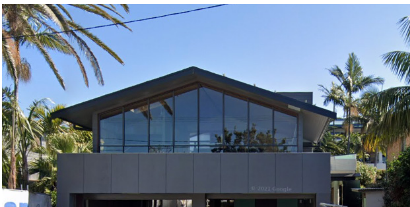
20 Cliff Road Collaroy NSW

Shingle: Independence in Georgetown Grey