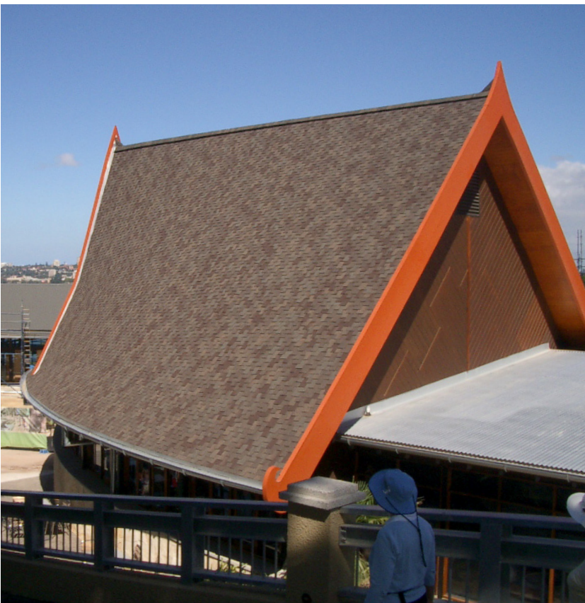
Taronga Food Market Athol Wharf Rd, Mosman NSW