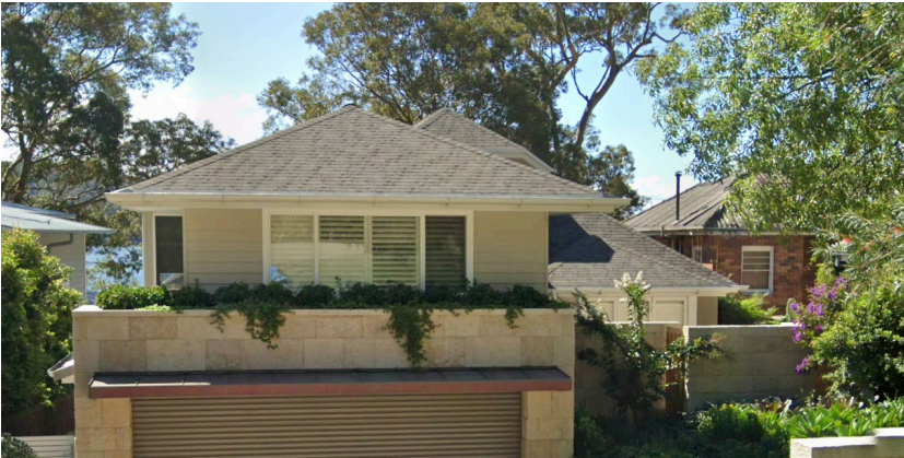
164 Hudson Parade Clareville NSW