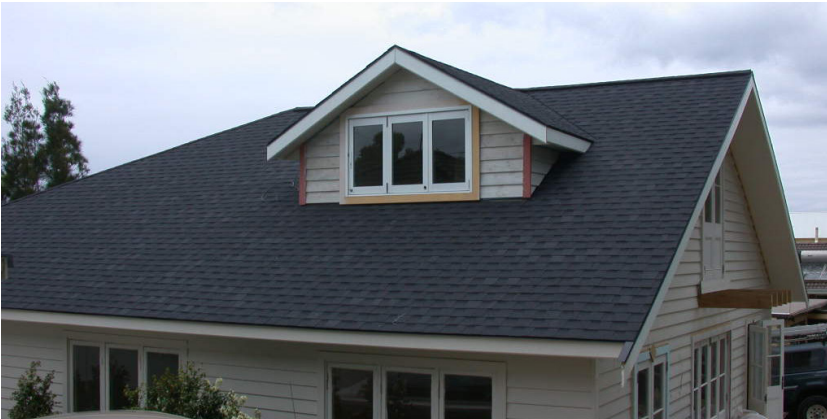
8 Beach Dr, Killcare NSW