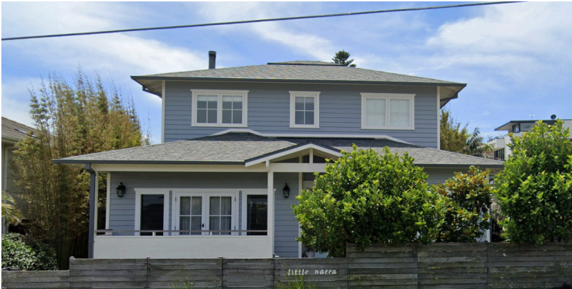
6 Narrabeen Park Parade Warriewood NSW