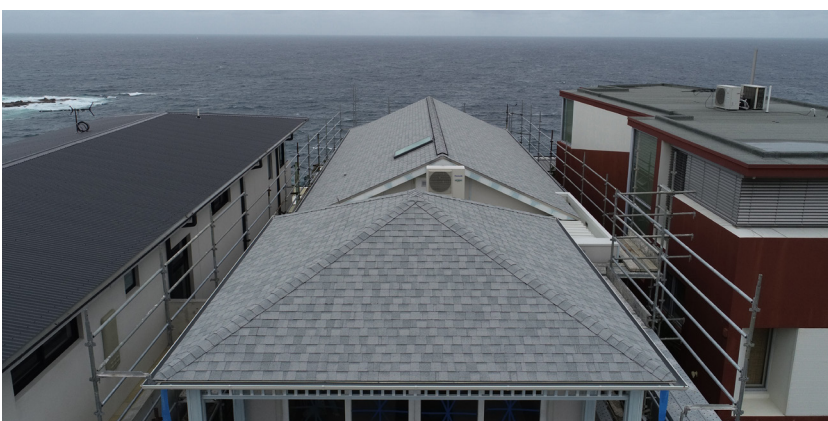
9 Denning St, South Coogee NSW