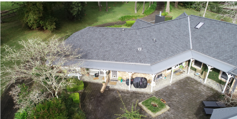
9 Okanagan Cl, Wamberal NSW