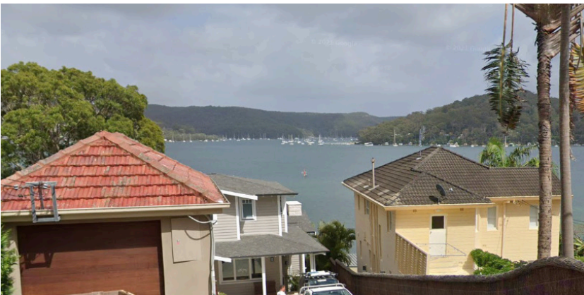
80 Prince Alfred Parade Newport NSW

This project has to be seen from the beach