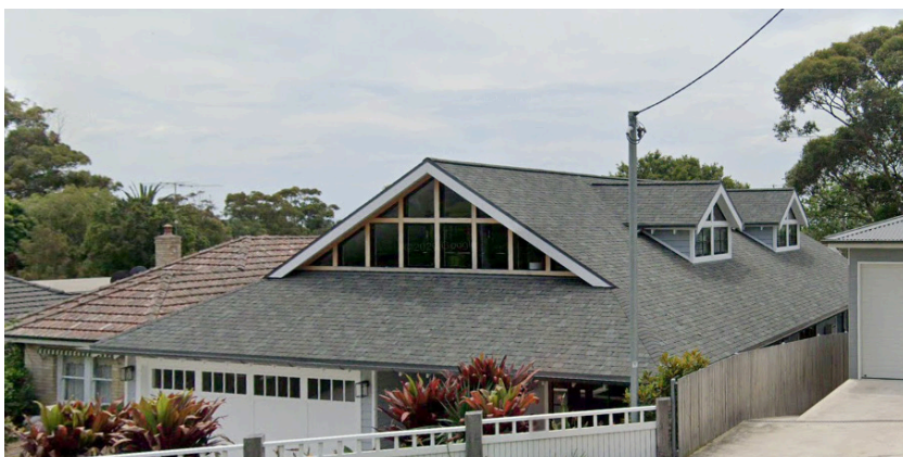
1 Worcester Street Collaroy NSW