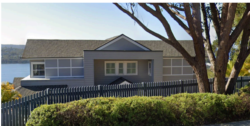
69 Edgecliffe Blvd Collaroy Plateau NSW